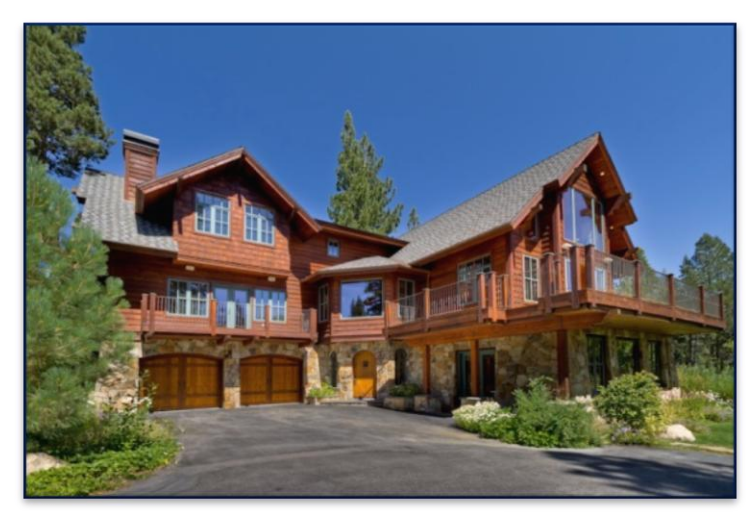
Squaw Valley Home

KSL, owner of Squaw and Alpine, continues to push forward with capital improvements which should attract more attention to these communities, but they face a headwind as Northstar continues to impress with their visitor traffic.