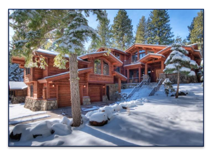
Northstar, CA Home

Northstar still feels competitive market pressure from surrounding communities like Martis Camp, but buyers in 2013 look to be placing value on being in Northstar proper.